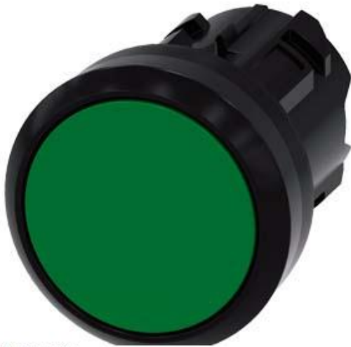
PUSHBUTTON, 22MM, ROUND, PLASTIC, GREEN, FLAT BUTTON, MOMENTARY CONTACT TYPE